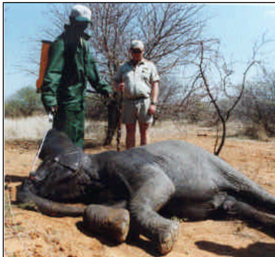
Figure # 3 An immobilized elephant is kept cool by an assistant spraying it with water. The elephants ear is folded forward to protect its eye from the sun.