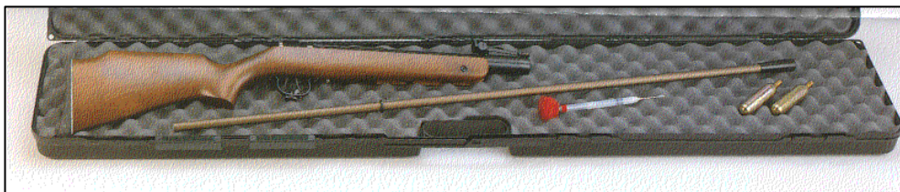
Figure # 1 A dart gun used to inject animals with immobilizing drugs during capture.

Animals may be captured by being injected with immobilizing drugs . This method is used in the capture of rare and valuable herbivores on an individual basis . It requires great skill, scientific knowledge and experience to immobilize wild animals. Drugs are usually injected by firing a dart from a dartgun into the muscle of the animal, but can also be administered manually, for example when animals are caught in a net.