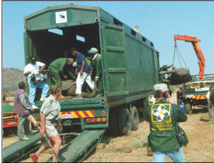
Figure # 4 An elephant is loaded into a recovery vehicle with the use of a crane. Once inside the recovery vehicle an antidote is administered to revive the animal.