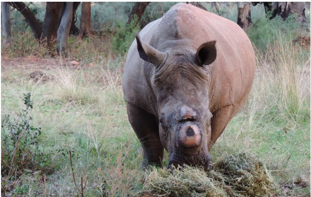
A dehorned rhino