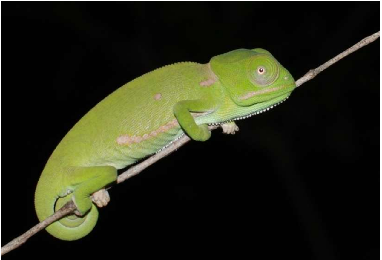
A flap-necked chameleon

This is to kill, trap, capture, remove or keep any product of fauna or flora without a permit or permission.