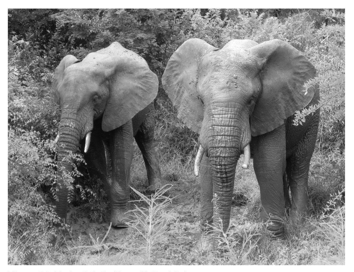
Figure 1.1 Elephants in the Kruger National Park

An adult cow stands about 2.5 to 2.8 m high at the shoulder (Table 1.2 and Figure 1.2). Bulls can reach a shoulder height of up to 3.6 m, depending on their habitat. There is considerable variation in shoulder height throughout the African continent, both between regions and among individuals in the same population.